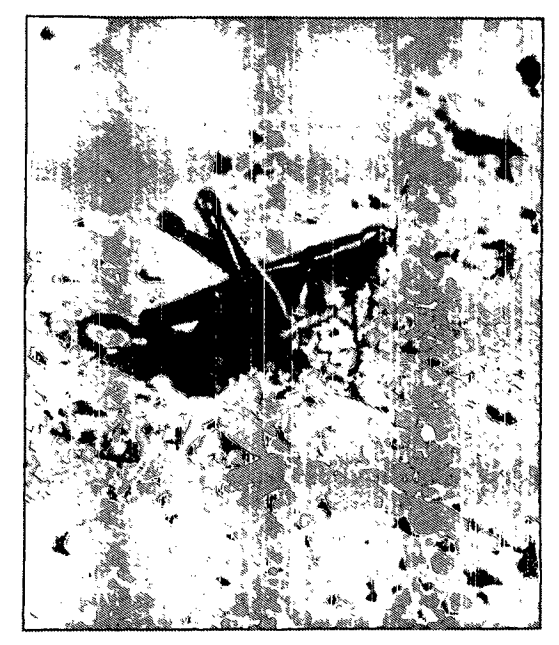
GRASSHOPPER - ANITA CARPENTER