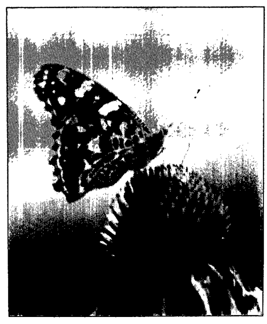
PAINTED LADY - ANITA CARPENTER