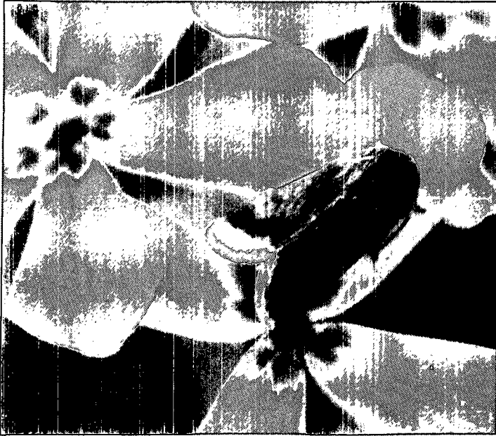
PHLOX FLOWER MOTH - LES FERGE