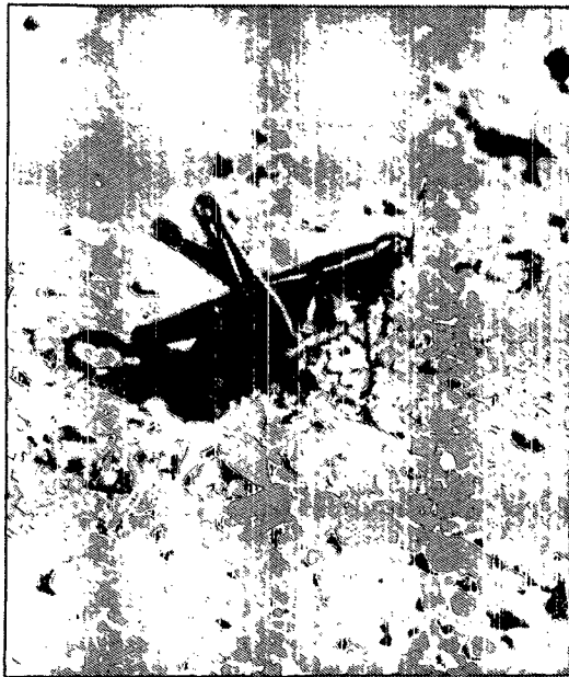
GRASSHOPPER - ANITA CARPENTER